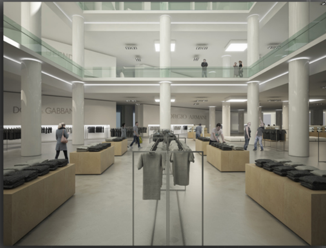
SOLUTION 1 - CORIAN