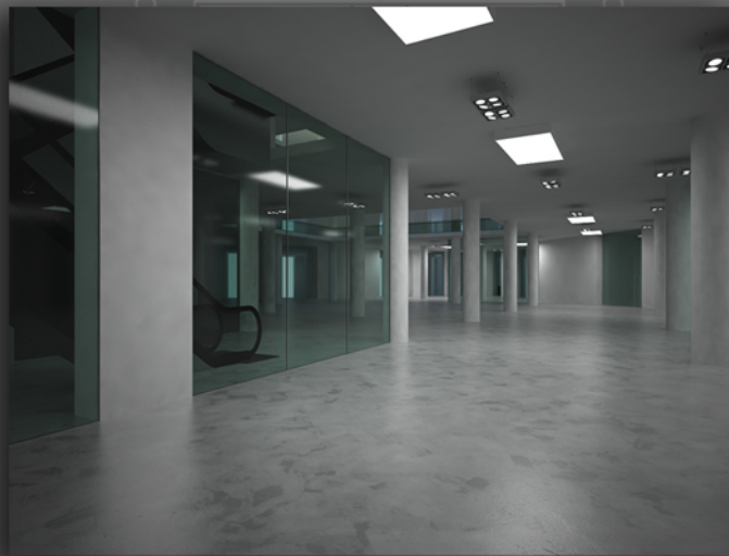
PHASE 2 - WITH PARTITION AND PLANTS