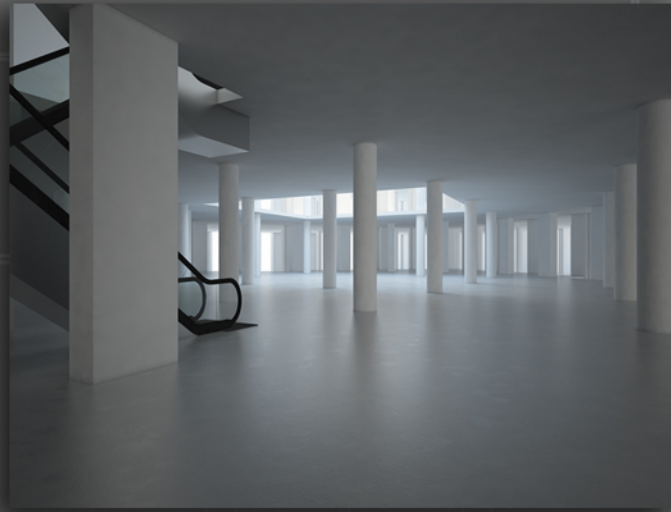
PHASE 1 - RUSTIC FINISHES