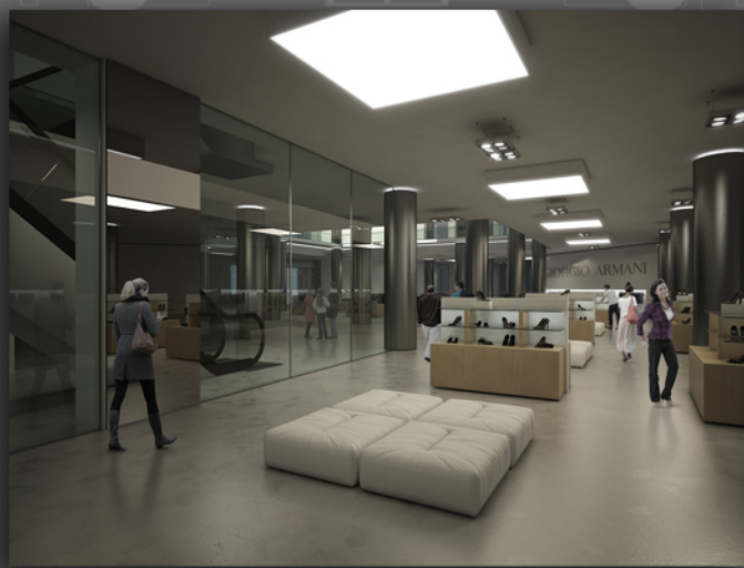
PHASE 3 - TURNKEY SOLUTION