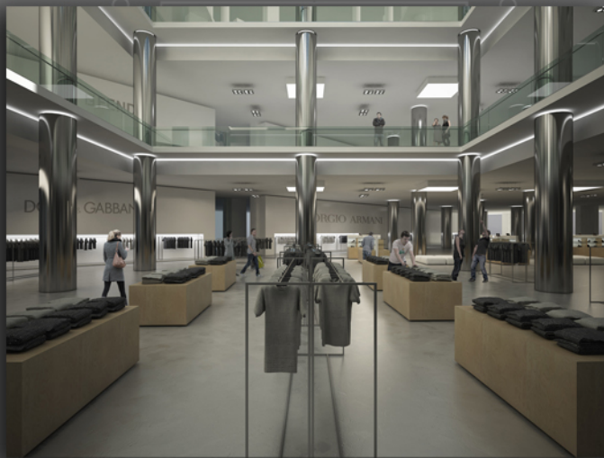
SOLUTION 2 - STAINLESS STEEL