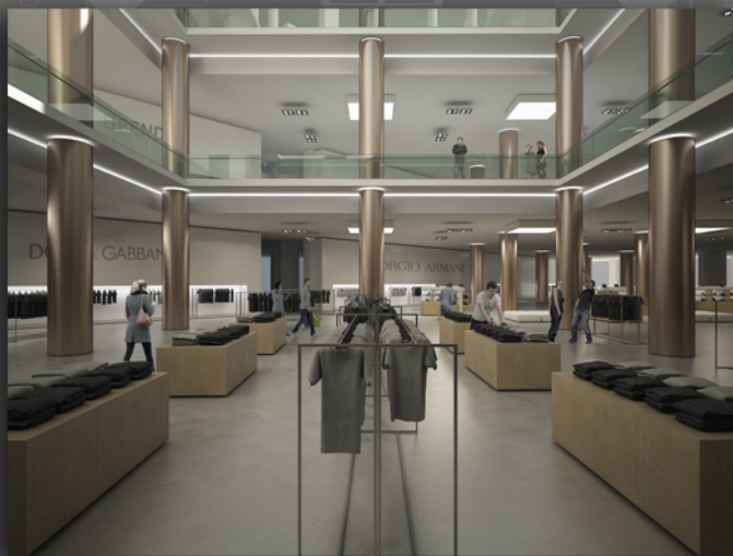
SOLUTION 3 - BRONZE